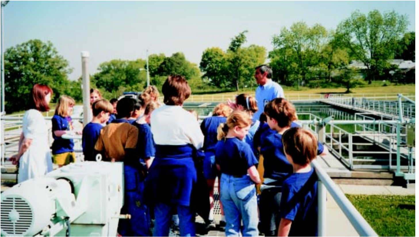
Above and Below: Bluff Park Elementary School students tour Birmingham's Putnam Filter Water Treatment Plant on the class trip they won in the ASCE annual coloring book contest.